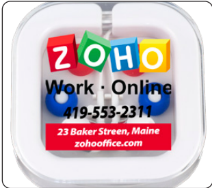
Shown with Photolmage® Full Color Imprint*