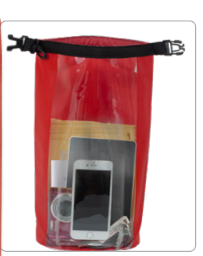
Clear See-Through Window on Backside with Clear Phone Pocket