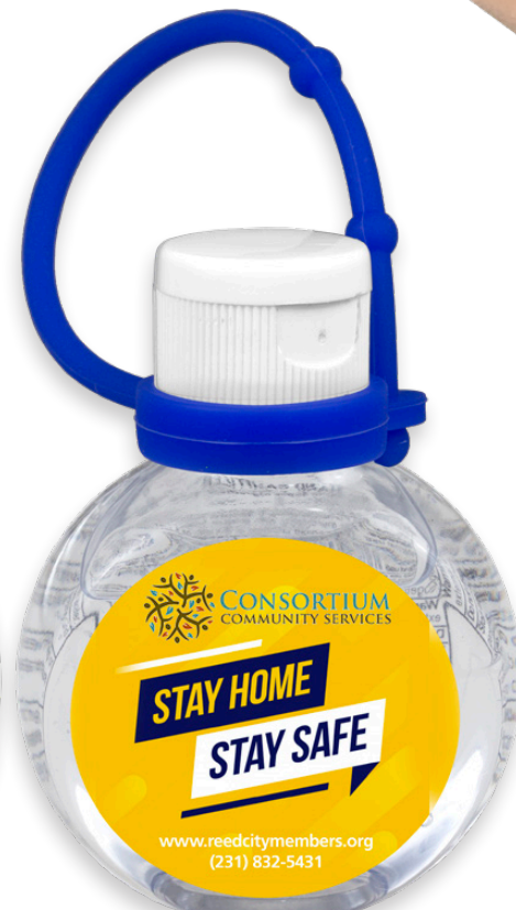
#5416 Shown with Full Color Label*