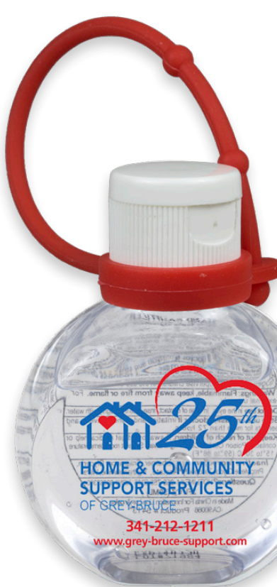
#5416S Shown with Spot Color Direct Print