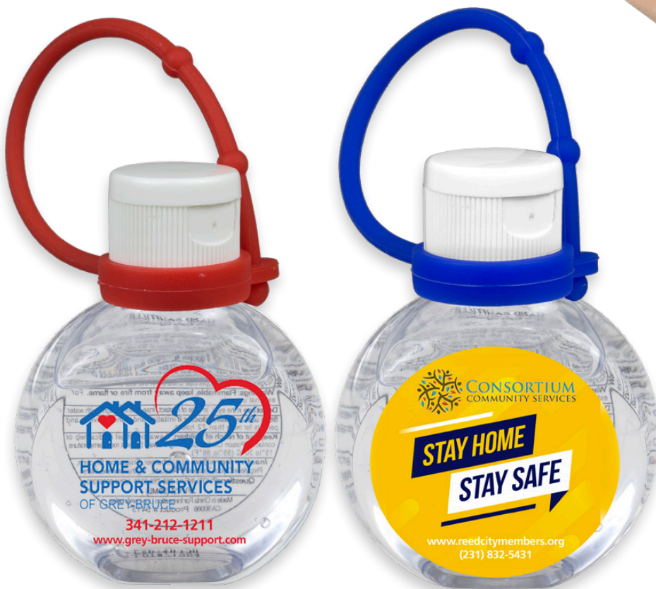
#5416S Shown with Spot Color Direct Print