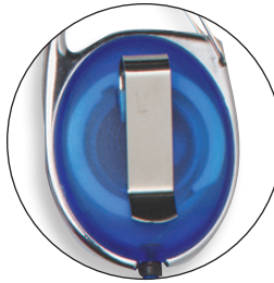
Metal Slip Clip Designed For Scrubs & Uniforms