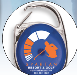
Carabiner style clip for belt loops and bags.