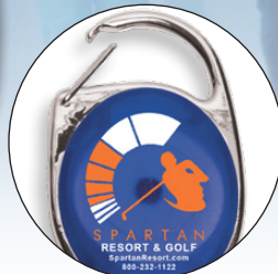
Carabiner style clip for belt loops and bags.