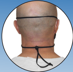
Adjustable Head Straps