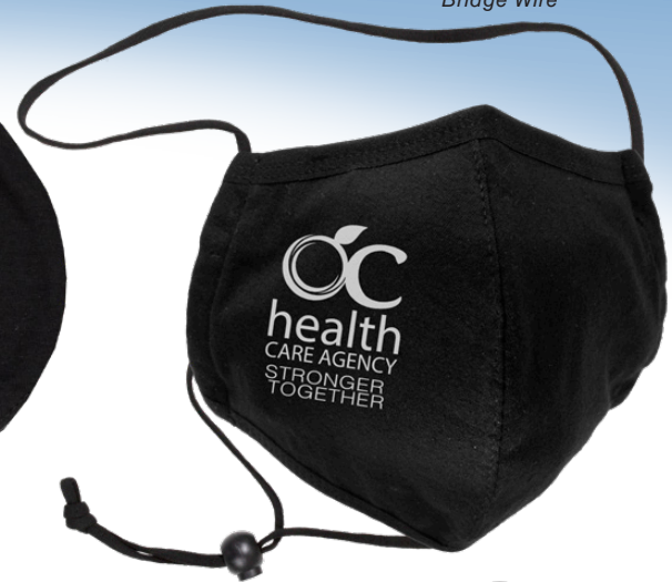
Adjustable Head Straps