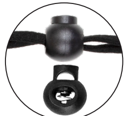
Head Strap Size Adjuster