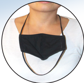
Mask Can Hang From Neck When Not in Use