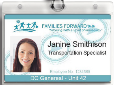
ID Card Not Included