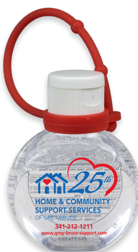
#5416S Shown with Spot Color Direct Print