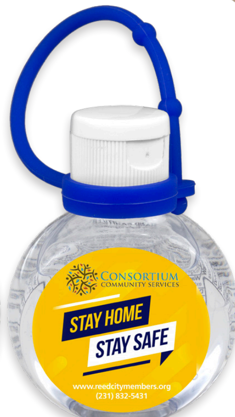
#5416 Shown with Full Color Label*