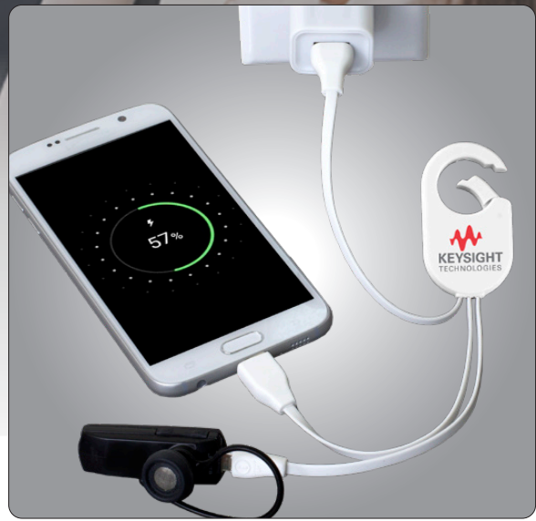
CONVENIENT WAY TO CHARGE YOUR DEVICES