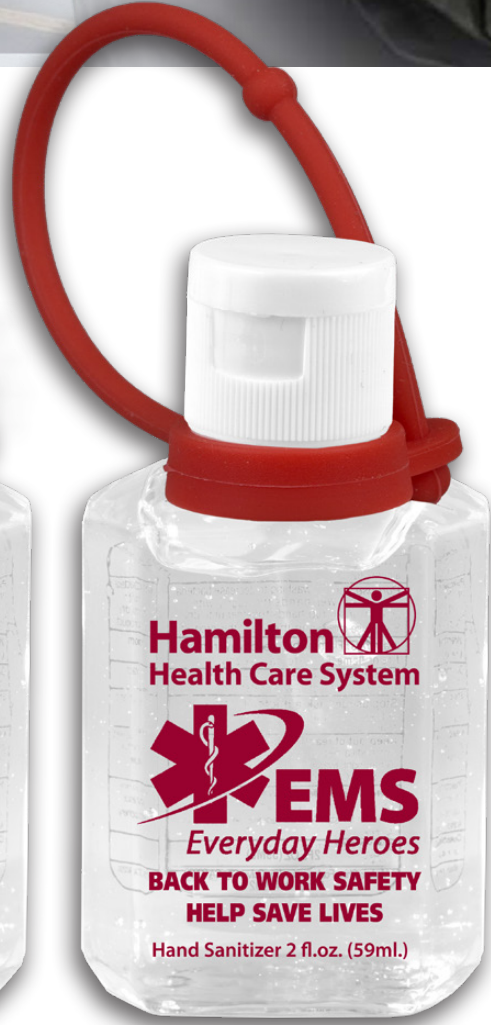
#1912S Shown with Spot Color Direct Print