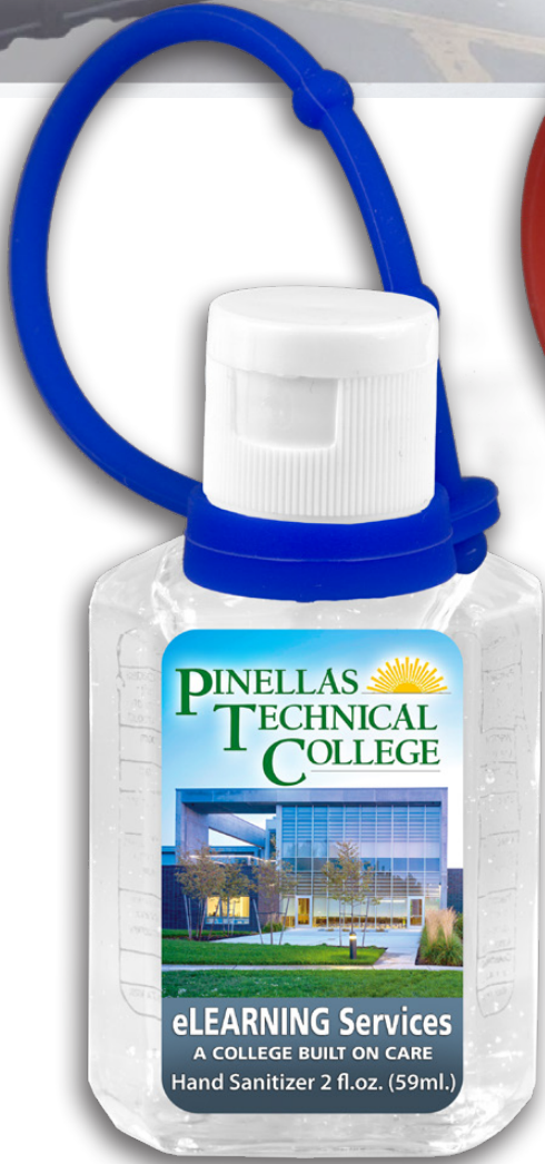
#1912 Shown with Full Color Label*