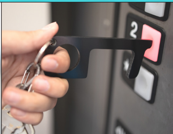
To Push Elevators Buttons