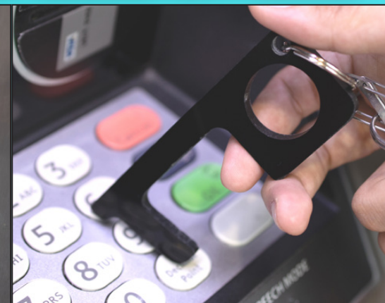
Use at Keypads on ATM and Gas Stations