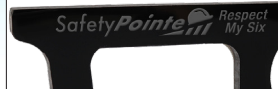
#KKEY19P Shown with Optional Full Color Imprint*