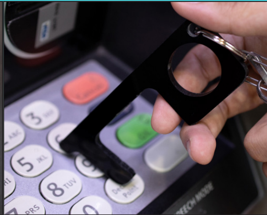
Use at Keypads on ATM and Gas Stations