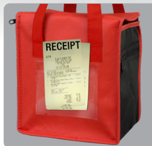
Clear Delivery Receipt Pocket on Backside