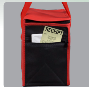
Zippered Pockets On Each Side