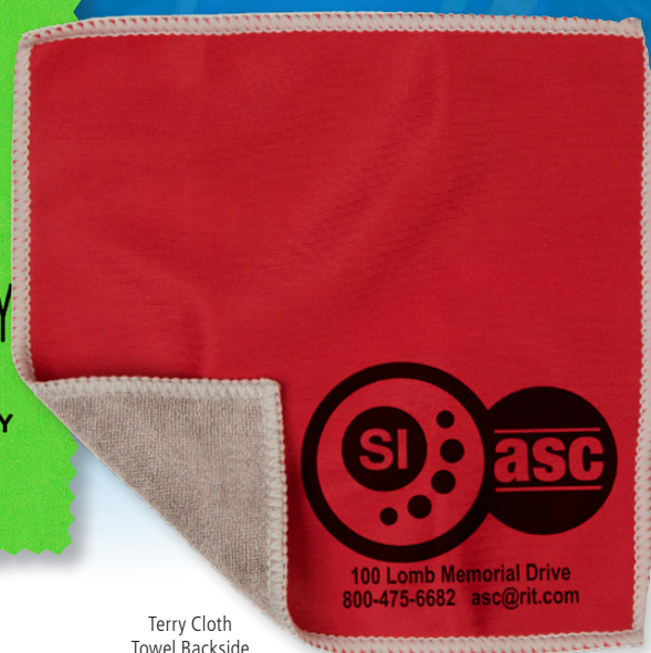
Terry Cloth Towel Backside

#5088 OneCleanScreen 100% Microfiber Cleaning Cloth Size: 6" W X 6" H. Imprint Area: 2-1/2" W x 2-1/2" H bottom right hand corner. Material: 170GSM Microfiber