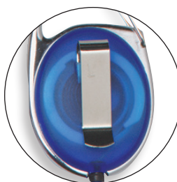
Metal Slip Clip Designed For Scrubs & Uniforms