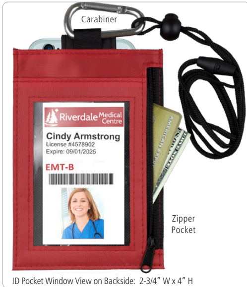
ID Pocket Window View on Backside: 2-3/4" W x 4" H