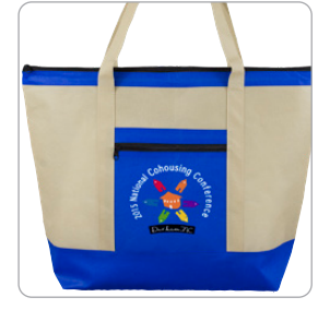
Shown with Optional 4 Color Process Imprint* add 1.10 (G) running charge

Setup Charge: 55.00 (G) per color, per location. Price Includes: One color imprint, one location. Additional Color Imprint: add .50 (G) running charge, plus Setup Charge.PMS Color Match Charge: 40.00 (G) per color. *PhotoImage® Full Color Imprint Setup Charge: add 1.10 (G) running charge, plus 55.00 (G) Setup Charge. Up to a Full Color Imprint. Exact color match cannot be achieved. Add 3 Days to Production. Repeat Setup Charge: 27.50 (G). Email Proof Charge: 7.50 (G), add 2 days to production time. Production Time: 5 Days. Packaging: Polybaq. Weight: 16 lbs. (100pcs.). Material: 80GSM Non-Woven Polypropylene . Iphone® and Apple® are registered trademarks of the Apple® corporation.