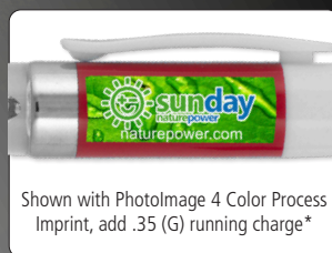
Shown with PhotolImage 4 Color Process Imprint, add .35 (G) running charge*

Price Includes: One color imprint, one location. Setup Charge: 55.00 (G) per color. Additional Colors: .35 (G) running charge, plus setup. PMS Color Match Charge: 40.00 (G) per color, not available for Full Color Imprint. *PhotolImage® Full Color Imprint Setup Charge: 55.00 (G). Price Includes: up to a Full Color Imprint. Email Proof Charge: 7.50 (G), add 2 days to production. Repeat Setup Charge: 27.50 (G). Battery life subject to individual use. Weight: 7 lbs. (100 pcs.) Packaging: Bulk. Size: 5-3/4" W x 5/8" H. Imprint: 1" W x 3/8" H (Horizontal Imprint is Standard). Pen Ink Color: Black only.