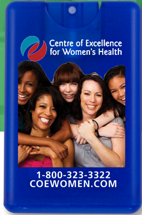
#52474 Shown with Photolmage® Full Color Imprint* add .04 (C) running charge.