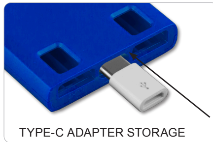
TYPE-C ADAPTER STORAGE