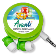
Lime Green Shown with PhotolImage® Full Color Imprint* add .45 (G) running charge

Screen Setup Charge: 55.00 (G) per color. Price Includes: One color imprint, one location. Additional Color Imprint: add .30 (G) running charge plus Setup Charge. PMS Color Match: 40.00 (G) per color, not available for Full Color Imprint. *PhotolImage® Full Color Imprint: add .45 (C) running charge plus 55.00 (G) Setup Charge. Up to a 4 color process imprint. Exact color match for Full Color Imprint is not guaranteed. Email Proof: 7.50 (G), add 2 days to production time. Repeat Setup: 27.50 (G). Production Time: 5 Days. Weight: 5-1/2 lbs. (100pcs.). Packaging: Bulk. Size: 2" Diam. Imprint: 1-5/8" Diam.