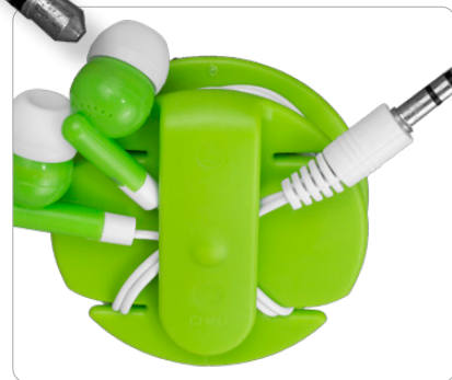
Backside cable organizer