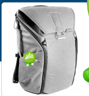
Clip onto belts, pockets or bags.