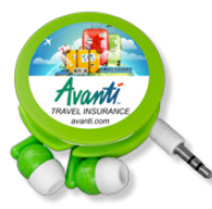
Lime Green Shown with PhotolImage® Full Color Imprint* add .45 (G) running charge

Screen Setup Charge: 55.00 (G) per color. Price Includes: One color imprint, one location. Additional Color Imprint: add .30 (G) running charge plus Setup Charge. PMS Color Match: 40.00 (G) per color, not available for Full Color Imprint. *PhotolImage® Full Color Imprint: add .45 (C) running charge plus 55.00 (G) Setup Charge. Up to a 4 color process imprint. Exact color match for Full Color Imprint is not guaranteed. Email Proof: 7.50 (G), add 2 days to production time. Repeat Setup: 27.50 (G). Production Time: 5 Days. Weight: 5-1/2 lbs. (100pcs.). Packaging: Bulk. Size: 2" Diam. Imprint: 1-5/8" Diam.