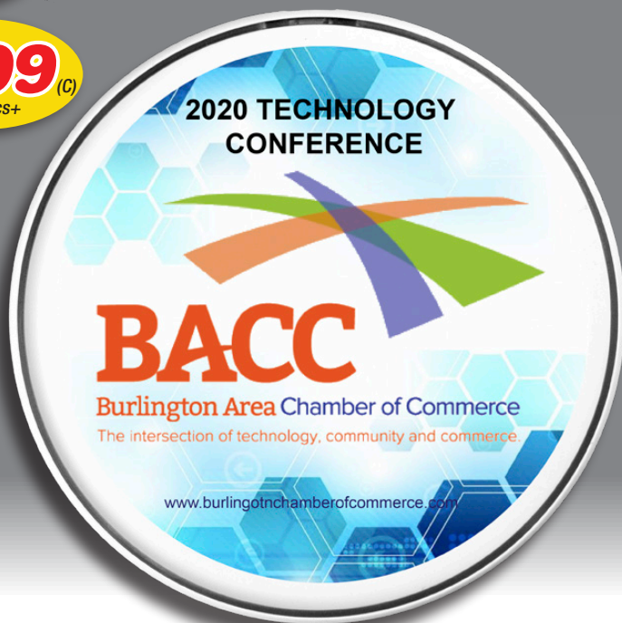
Shown with Photolmage® Full Color Imprint* add .30 (G) running charge