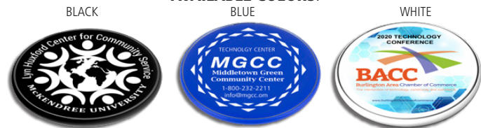
Shown with Photolmage® Full Color Imprint* add .30 (G) running charge

Screen Setup Charge: 55.00 (G). Price Includes: One color imprint, one location. PMS Color Match: 40.00 (G). *Photolmage® Full-Color Imprint Charge: add .30 (G) running charge. Production Time: 5 Days. Email Proof: 7.50 (G), add 2 days to production time. Repeat Setup: 27.50 (G). Weight: 9 lbs. (50pcs.) Packaging: White Box. Material: ABS Plastic. Size: 3 7/8" dia. Imprint: 2 3/4" dia. *iPhone is a registered trademark of Apple Inc. For a list of compatible wireless phones see website.