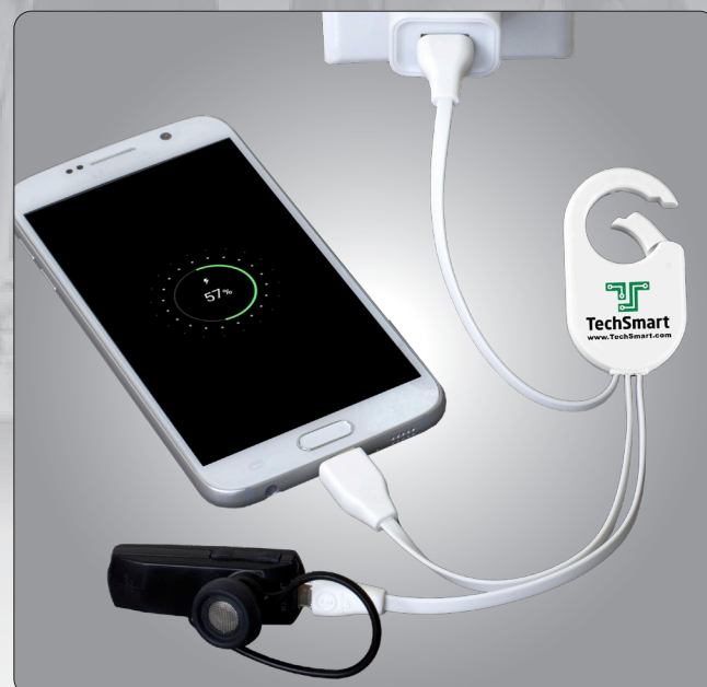
CONVENIENT WAY TO CHARGE YOUR DEVICES