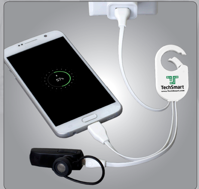
CONVENIENT WAY TO CHARGE YOUR DEVICES