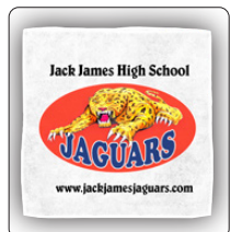
Shown with Optional Photolmage® Full Color Imprint

Please note: Fine lines have a tendency to break and/or appear broken when printing on cloth materials. Some fine details may be lost during printing as well as fade quickly after printing. Imprint will deteriorate with washing and normal use and this is not considered a defect. Thin lines and fine type may be difficult to read or break up when printed on the fiber loops of this product and as a result imprint will vary from piece to piece. INTENDED FOR DRY USE ONLY. Important Information: Variations in print substrates/materials make it impossible to exactly duplicate PMS colors on Innovation Line products. Color variation cannot be considered a defect due to ink, lighting, material or any other variation. PMS color matching is not possible for any imprint method, including screen print, pad print, Photolmage® full color direct, full color label, transfer and sublimation. PMS is only a reference point and an approximation. Each product is manufactured and printed individually, so 3/16" movement in logo alignment may result and cannot be considered a defect in printing. Note on proofs: E Proofs are for logo placement and size approval only. The colors shown on e-proofs will not be accurately represented on monitors. Therefore, e-proofs cannot be an exact color representation and factory is not responsible for ANY variation. 1202