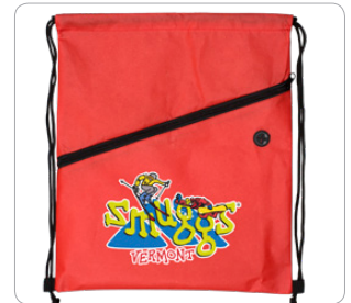
Shown with Photolmage® Full Color Imprint*

Setup Charge: 55.00 (G) per color, per location. Price Includes: One color imprint, one location. 2nd Color/Location Imprint: add .50 (G) running charge, plus Setup Charge. PMS Color Match: 40.00 (G) per color, not available for 4 color process imprint. *Photolmage® Full Color Imprint: add 1.10 (G) running charge (minimum 250 pieces), plus 55.00 (G) Setup Charge, add 5 days production time. Repeat Setup: 25.00 (G). Email Proof: 7.50 (G), add 2 days to production time. Packaging: Bulk. Production Time: 5 Days. Weight: 14 lbs. (100 pcs.). Material: 80 GSM Non-Woven Polypropylene.