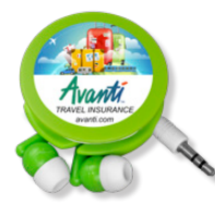
Lime Green Shown with PhotoImage® Full Color Imprint*

Screen Setup Charge: 55.00 (G) per color. Price Includes: One color imprint, one location. Additional Color Imprint: add .30 (G) running charge plus Setup Charge. PMS Color Match: 40.00 (G) per color, not available for Full Color Imprint. *PhotoImage® Full Color Imprint: add .40 (C) running charge plus 55.00 (G) Setup Charge. Up to a 4 color process imprint. Exact color match for Full Color Imprint is not guaranteed. Email Proof: 7.50 (G), add 2 days to production time. Repeat Setup: 27.50 (G). Production Time: 5 Days. Weight: 5-1/2 lbs. (100pcs.). Packaging: Bulk