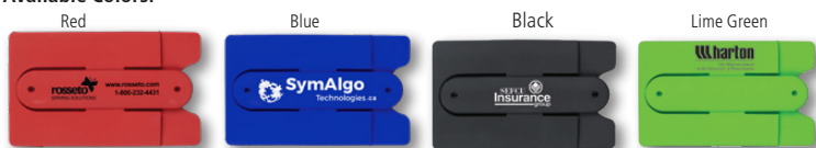
Shown with Above Panel Imprint