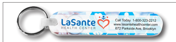
#5401 Shown with Optional Backside Imprint †

*PhotoImage ® Full Color Imprint Setup Charge: 55.00 (G) for one-sided imprint or same artwork used on both sides. If 2nd side imprint is a different image, add 55.00 (G) setup charge. Please note nail files and vinyl sleeves are packed bulk separately. To insert files into vinyl sleeves please add .25 (G) each and specify. Price Includes: up to a Full Color Imprint on one side of nail file. 2nd side imprint is available for additional charge shown in price chart.