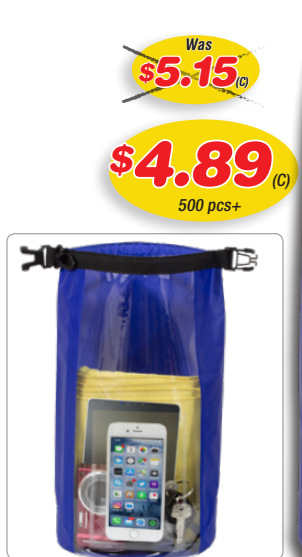
Clear See-Through Window on Backside with Clear Phone Pocket