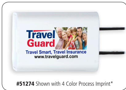
#51274 Shown with 4 Color Process Imprint*

Setup Charge: 55.00 (G) per color. Price Includes: One color imprint, one location. Additional Colors/2nd Location: .30 (G) running charge. PMS Color Match Charge: 40.00 (G) per color, not available for Full Color Imprint. *4 Color Process Setup Charge: 55.00 (G), plus .40 (G) running charge. (Exact color match for Full Color Imprint is not guaranteed). Email Proof Charge: 7.50 (G), add 2 days to production time. Repeat Setup Charge: 25.00 (G). Production Time: 5 days. Packaging: Polybag. Weight: 3-3/4 lbs. (100pcs.).