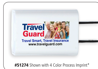
#51274 Shown with 4 Color Process Imprint*

Packaging: Polybag. Weight: 3-3/4 lbs. (100pcs.).