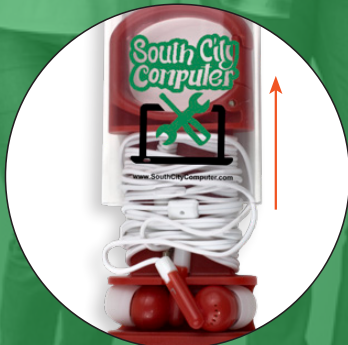
Slide Off Case Cover To Access Earbuds