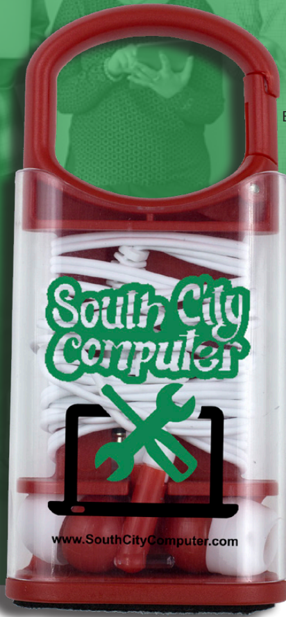
Carabiner For Attaching To Backpacks and Bags