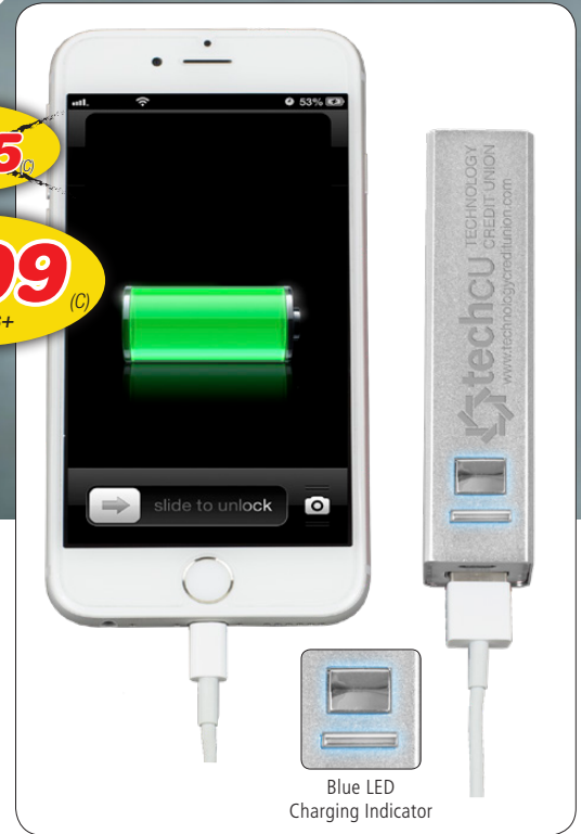
Ideal for charging mobile phones