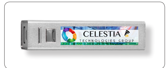
#PB1024 Shown with Photolmage © Full Color Imprint*

Power Bank Input DC 5V/550mA Output: DC 5V/1000mA Capacity: 2200mAh