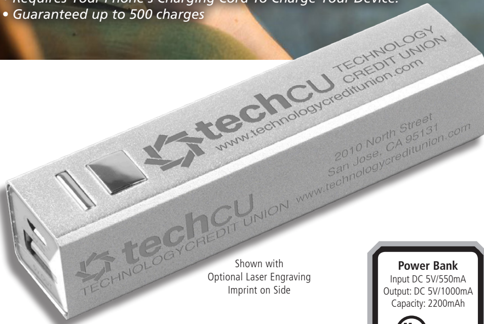
Shown with Optional Laser Engraving Imprint on Side