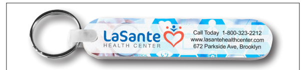
#5401 Shown with Optional Backside Imprint †

*PhotoImage © Full Color Imprint Setup Charge: 55.00 (G) for one-sided imprint or same artwork used on both sides. If 2nd side imprint is a different image, add 55.00 (G) setup charge. Please note nail files and vinyl sleeves are packed bulk separately. To insert files into vinyl sleeves please add .25 (G) each and specify. Price Includes: up to a Full Color Imprint on one side of nail file. 2nd side imprint is available for additional charge shown in price chart.