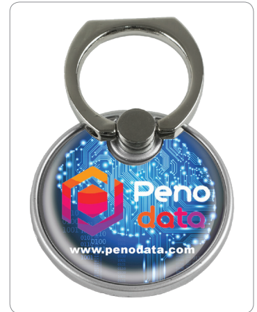
Shown with PhotImage® Full Color Imprint with Doming*