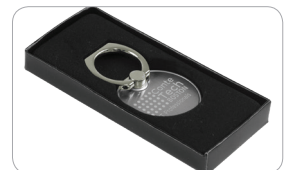
Gift Box included

Please note: Small shifting of imprint cannot be avoided when printing. As each product is manufactured and printed individually, up to 3/16" movement in logo alignment may occur. Phone holders are intended for individual use and cannot be compared. In 4-color process printing, exact color match cannot be achieved. None of these can be considered a defect. Adhesive strength may vary depending on materials used in the cell phone itself or aftermarket phone cases. 0325