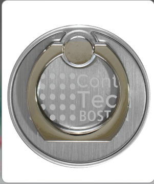
Shown with Ring In Standard Position