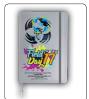
#9214 Shown with 4 Color Process Imprint*

Important Information: Variations in print substrates/materials make it impossible to exactly duplicate PMS colors on Innovation Line products. Color variation cannot be considered a defect due to ink, lighting, material or any other variation. PMS color matching is not possible for any imprint method, including screen print, pad print, PhotoImage @ full color direct, full color label, transfer and sublimation. PMS is only a reference point and an approximation. Each product is manufactured and printed individually, so 3/16" movement in logo alignment may result and cannot be considered a defect in printing. Note on proofs: E Proofs are for logo placement and size approval only. The colors shown on e-proofs will not be accurately represented on monitors. Therefore, e-proofs cannot be an exact color representation and factory is not responsible for ANY variation. 0912