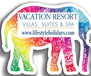
STK9 Upto 2 to 9 sq in*

Full Color Custom Contour Kiss Cut Removable Vinyl Stickers No Die Charges!