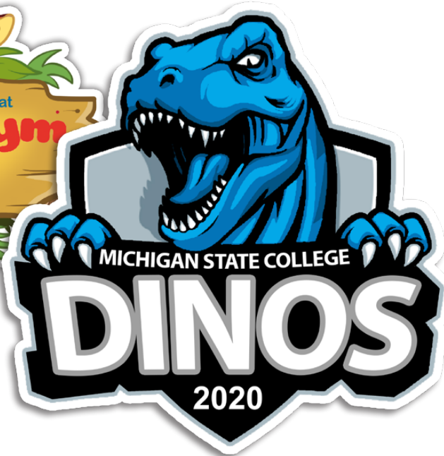
STK36 25.1 to 36 sq in