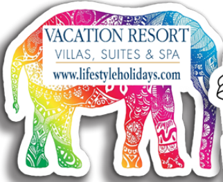
STK9 Upto 2 to 9 sq in*

Full Color Custom Contour Kiss Cut Removable Vinyl Stickers No Die Charges!