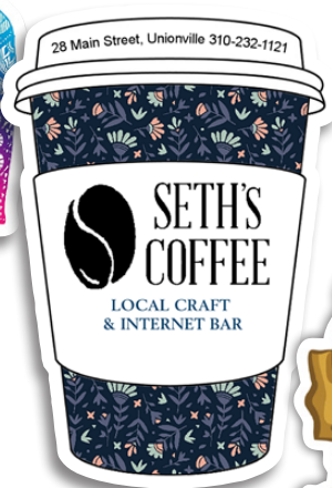
STK16 9.1 to 16 sq in