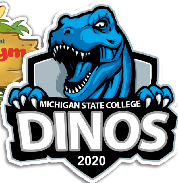
STK36 25.1 to 36 sq in