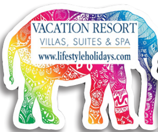
STK9 Upto 2 to 9 sq in*

Full Color Custom Contour Kiss Cut Removable Vinyl Stickers No Die Charges!