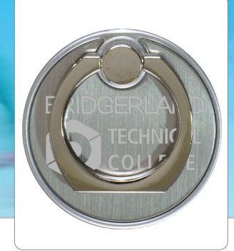
Shown with Ring In Standard Position