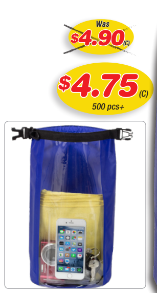
Clear See-Through Window on Backside with Clear Phone Pocket