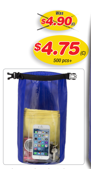
Clear See-Through Window on Backside with Clear Phone Pocket