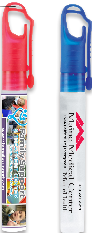
#5242 Shown with Multicolor Vinyl Label*