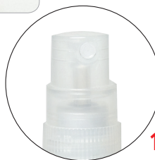
#5242S Shown with Spot Color Direct Print