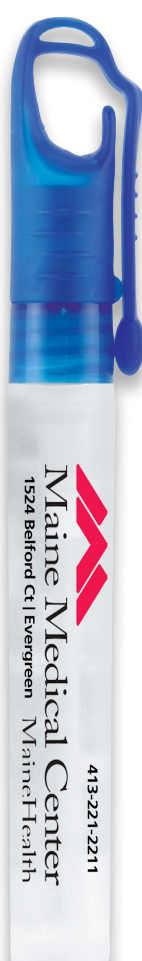
#5242S Shown with Spot Color Direct Print