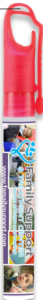
#5242 Shown with Multicolor Vinyl Label*