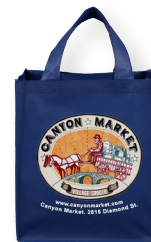
Shown with Optional PhotoImage® Full Color Imprint*

Setup Charge: 55.00 (G) per color, per location. Price Includes: One color imprint, one location. Additional Color/Location Imprint: add .50 (G) running charge. PMS Color Match: 40.00 (G) per color, not available for Full Color Imprint. *PhotoImage® Full Color Imprint Charge: add 1.10 running charge, plus 55.00 (G) Setup Charge. Price Includes: up to a Full Color Imprint. Add 3 Days to Production. Repeat Setup: 25.00 (G). Email Proof: 7.50 (G), add 2 days to production time. Production Time: 5 Days. Packaging: Bulk. Weight: 22 lbs. (100 pcs. Material: 80GSM Non-Woven Polypropylene.