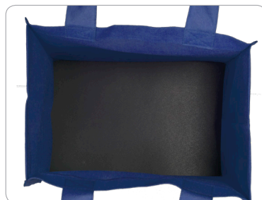
Includes a Black PE reinforced bottom insert